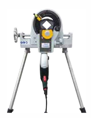
PS 4.5 Plus